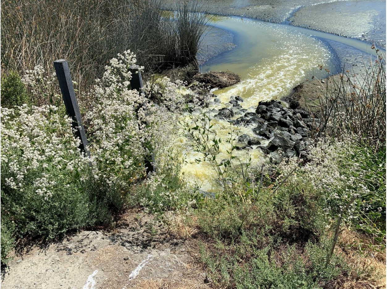
Unknown Odor Source Outfall Pipe During Low Tide