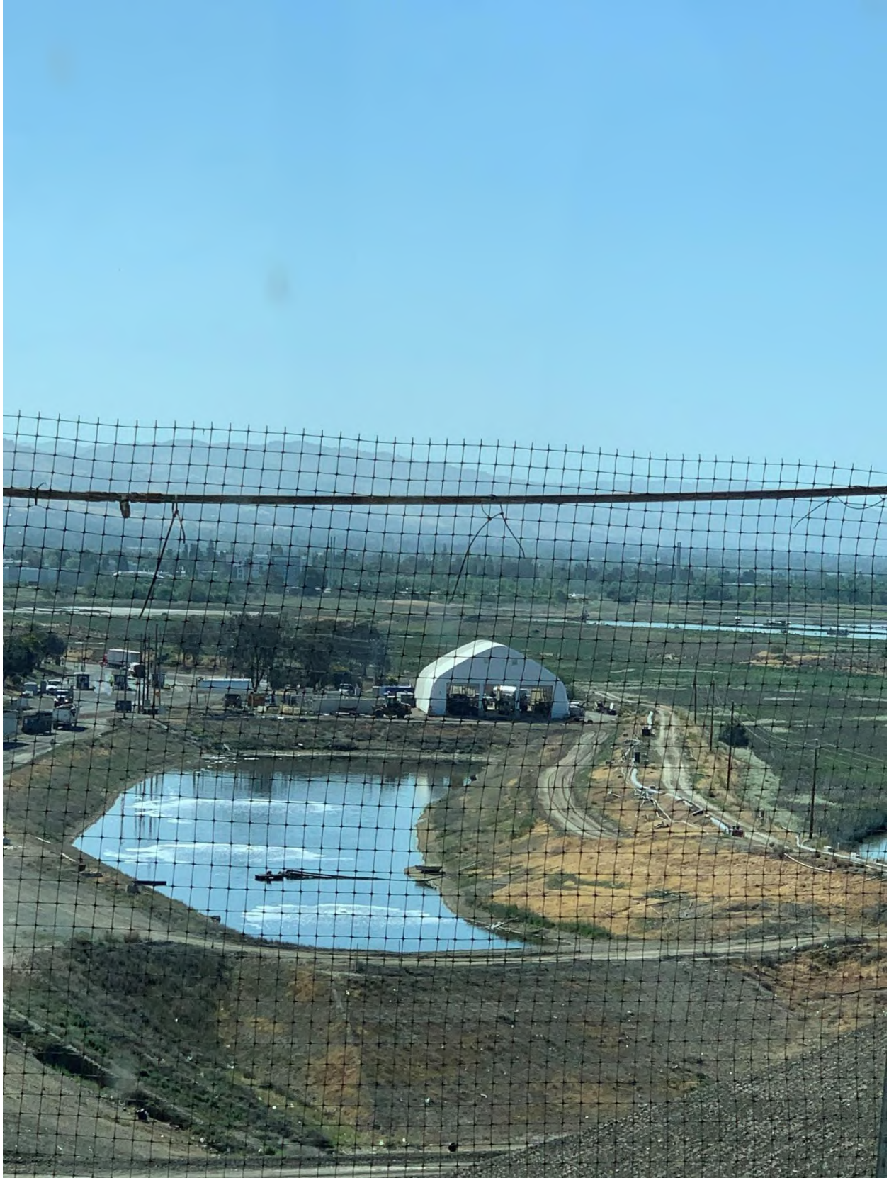
MRF Recycling Facility and Lagoon from Landfill