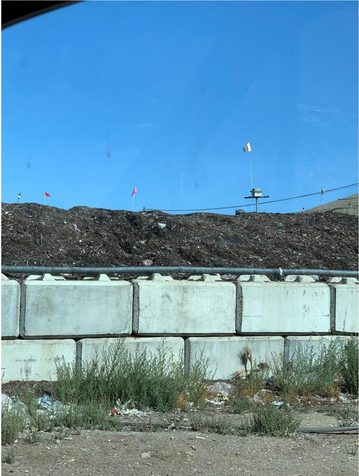
Compost Bins at Landfill