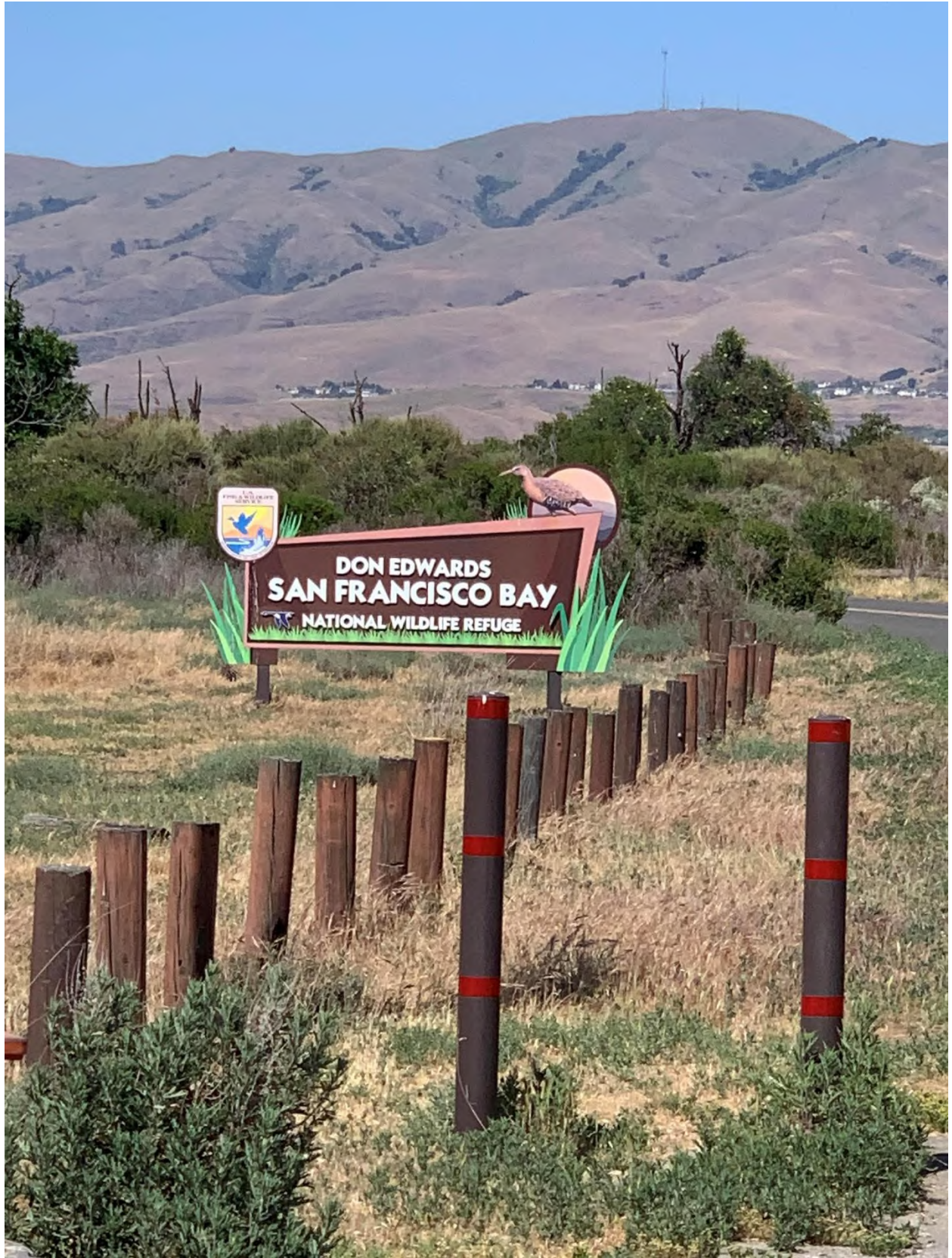
Location of unknown Odor Source Outfall Pipe