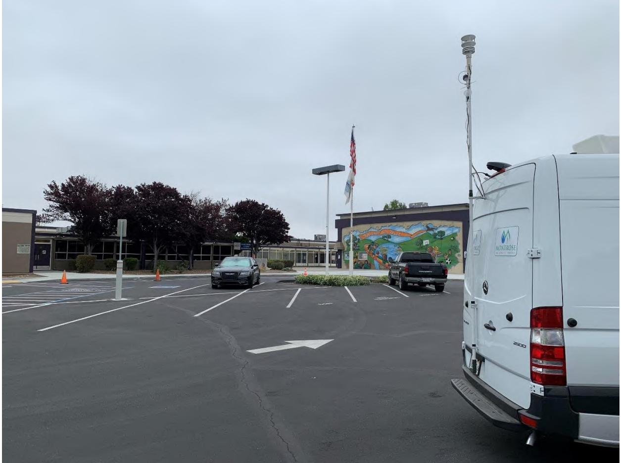
PTR Van at Milpitas, CA Elementary School