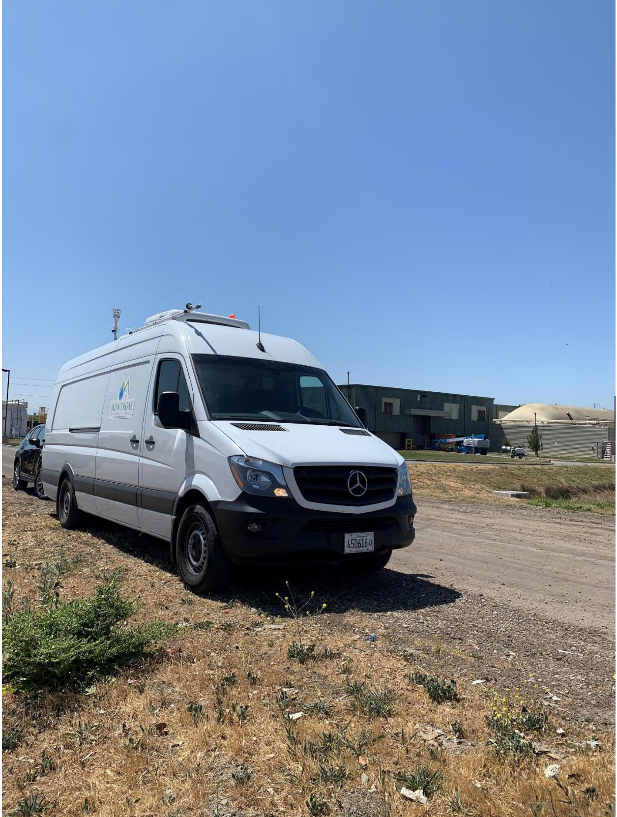
PTR Wet Fermentation and biofilters