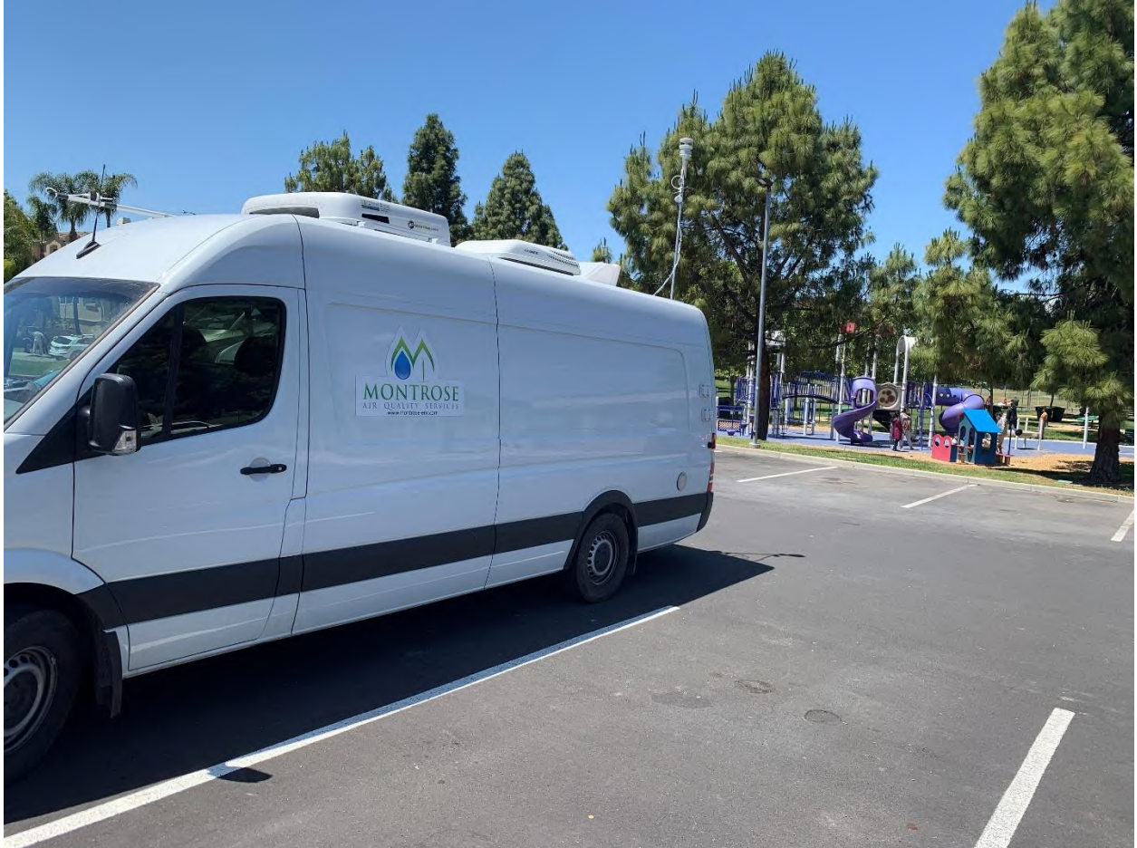
PTR Van at Milpitas, CA Park