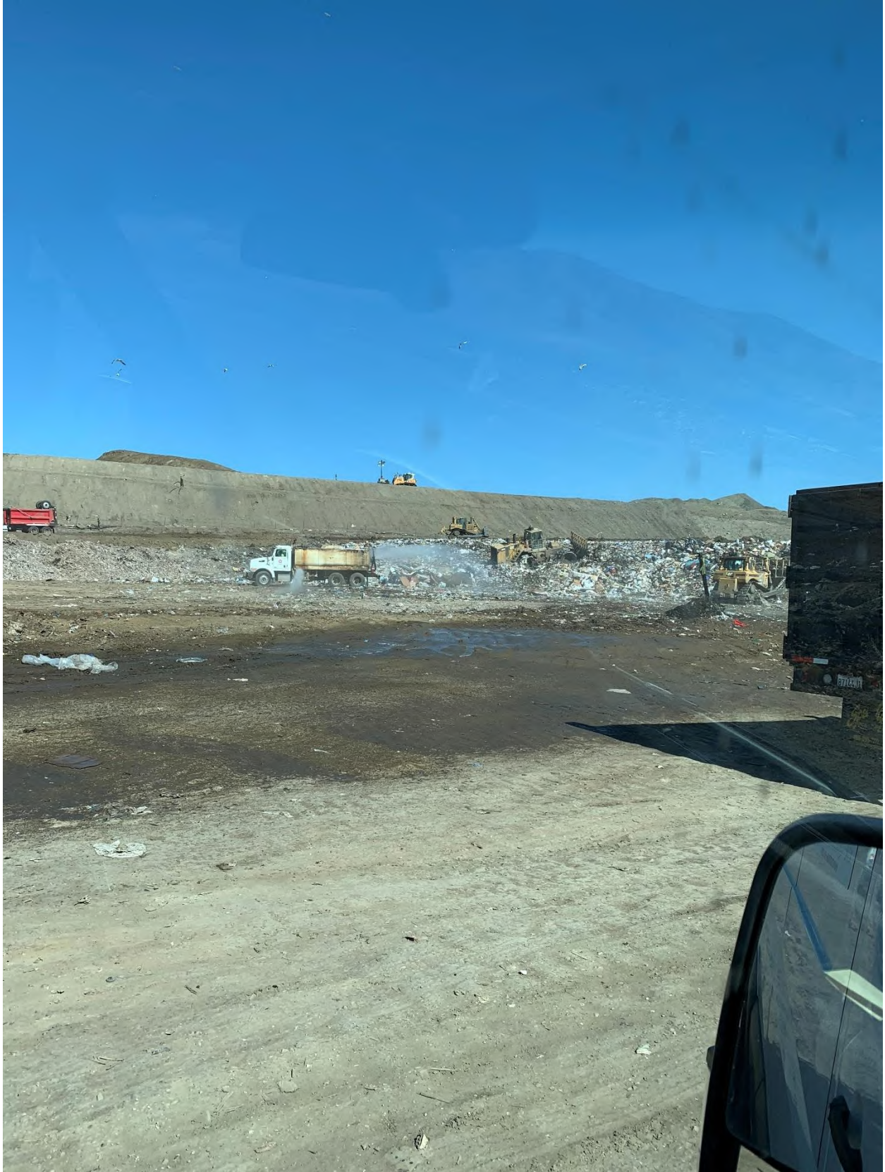
Landfill Working Face