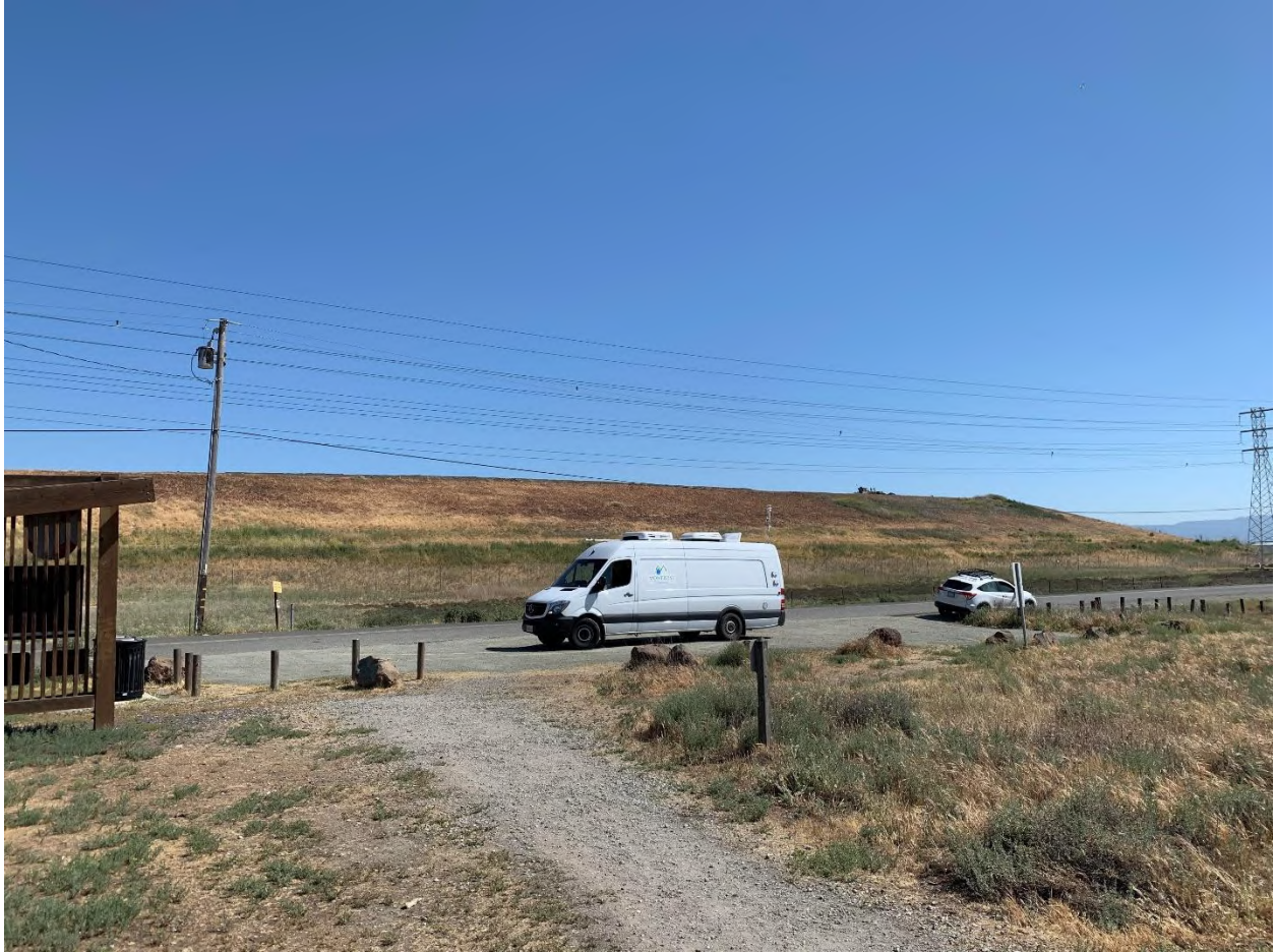
PTR at Don Edwards Estuary Wildlife Refuge