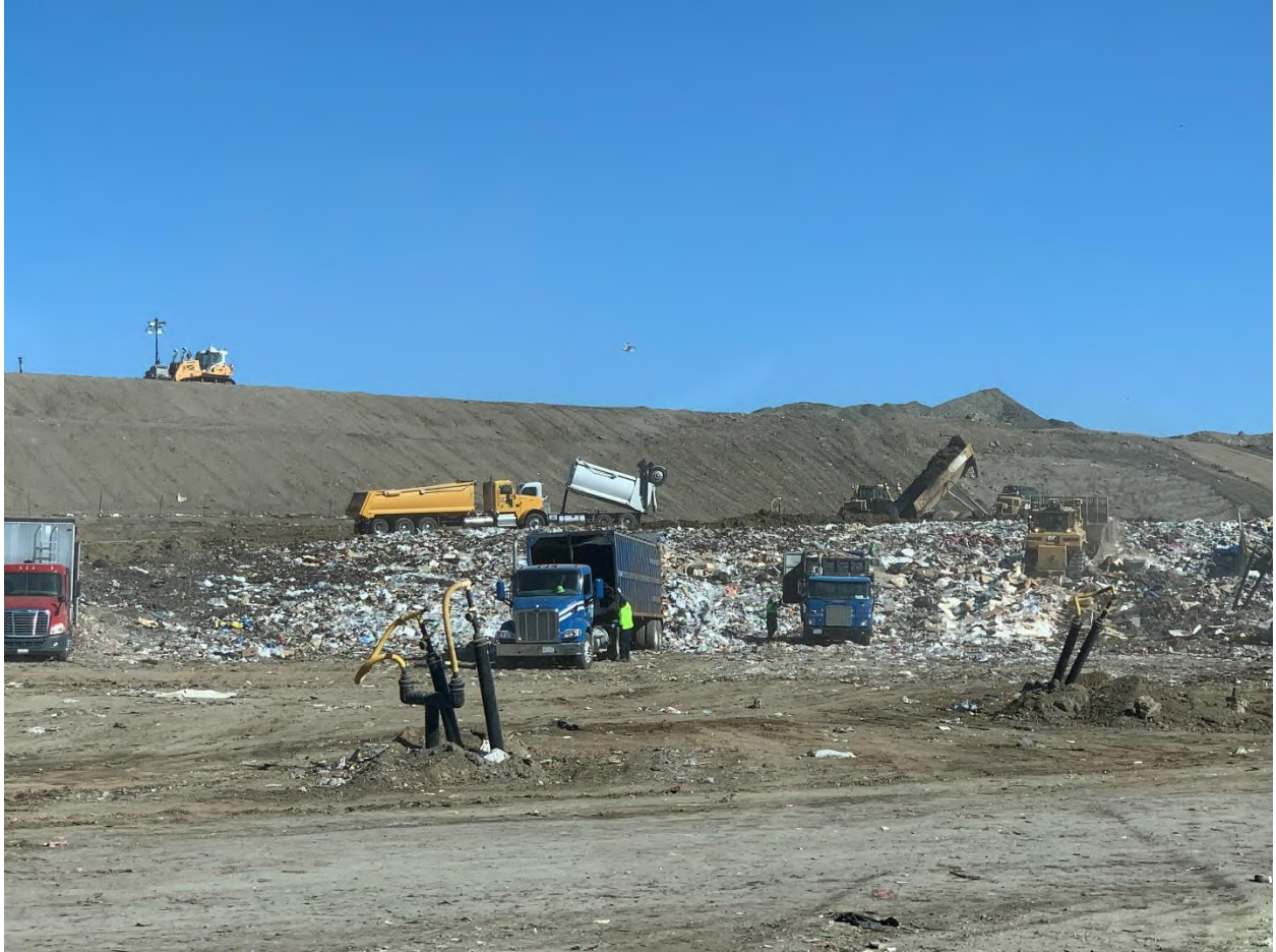
Landfill Working Face