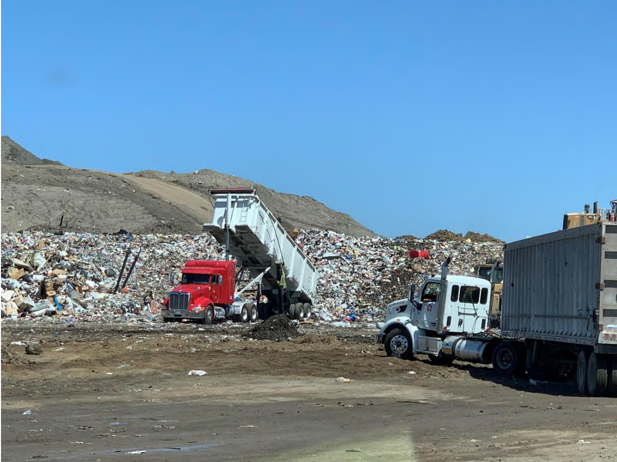
Landfill Working Face