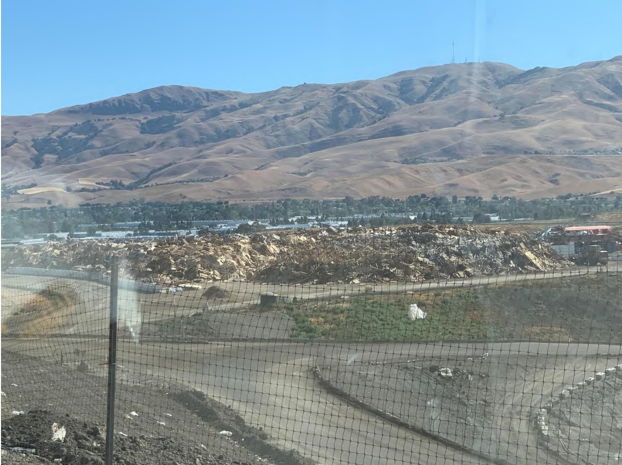
City of Milpitas from Landfill