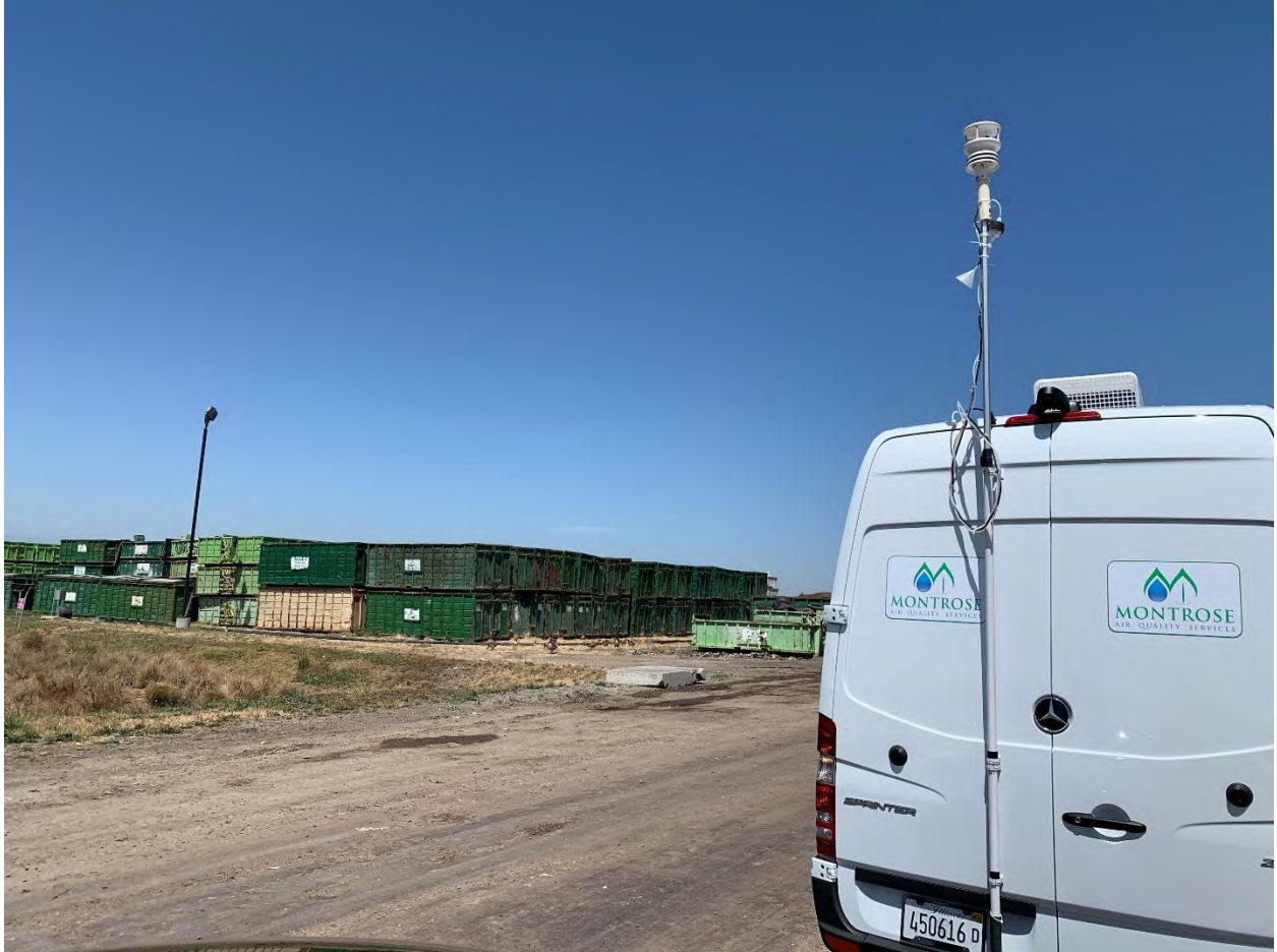
PTR in between MRF and Sludge Lagoons