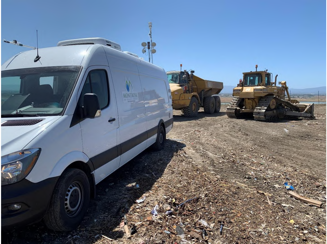
PTR at Landfill Working Face