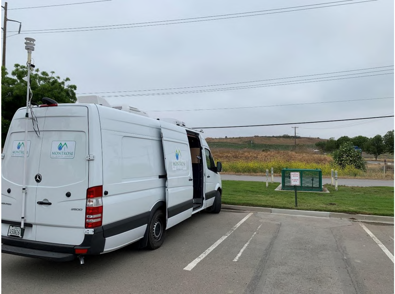
PTR Van Sampling Between SJWWTP and Wet Compost Facility