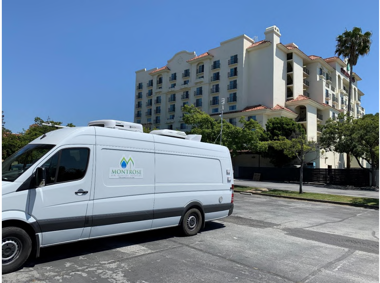
PTR Van Plume Sampling From Milpitas CA Hotel