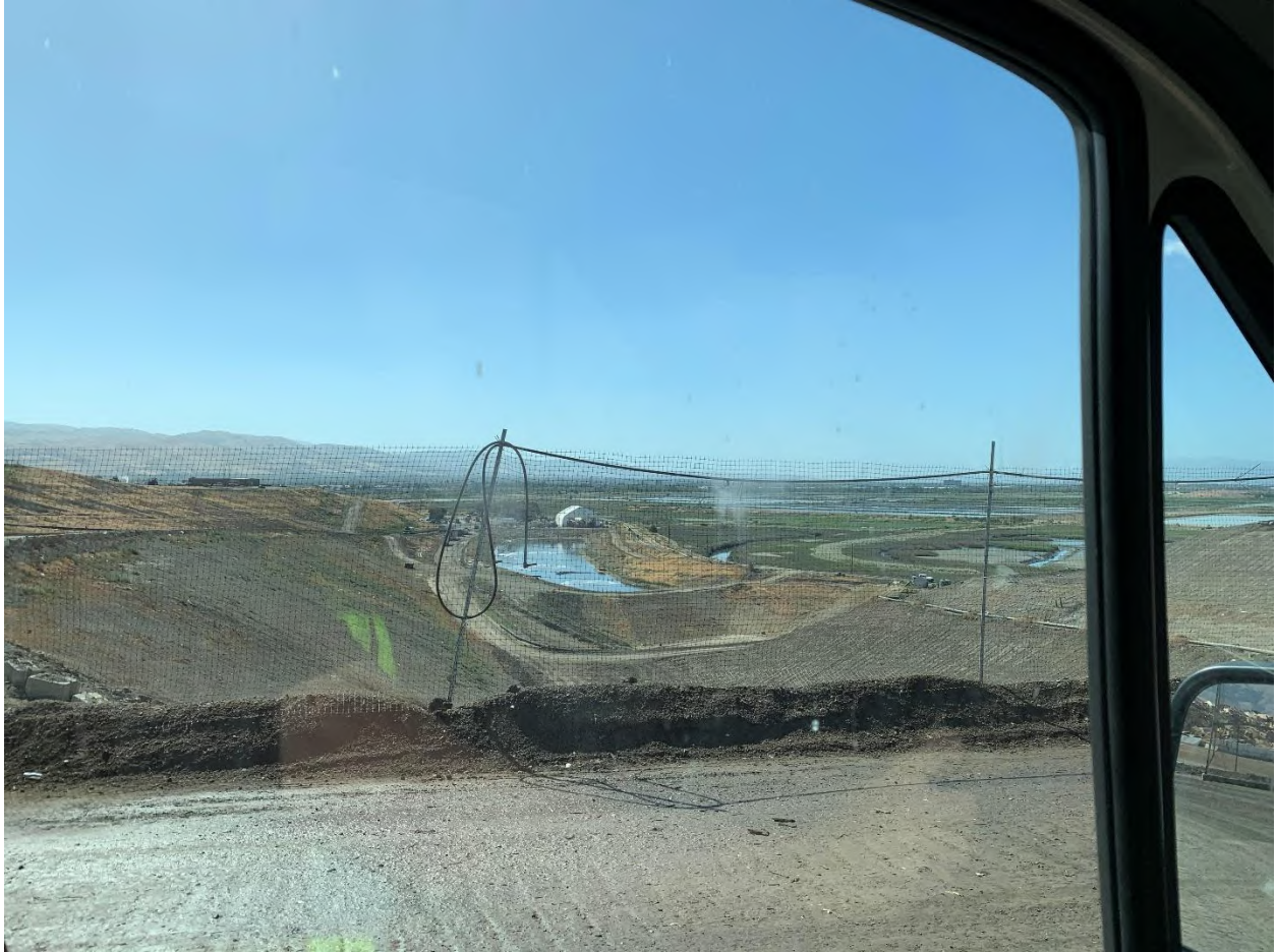
Landfill road with odor mitigation sprays