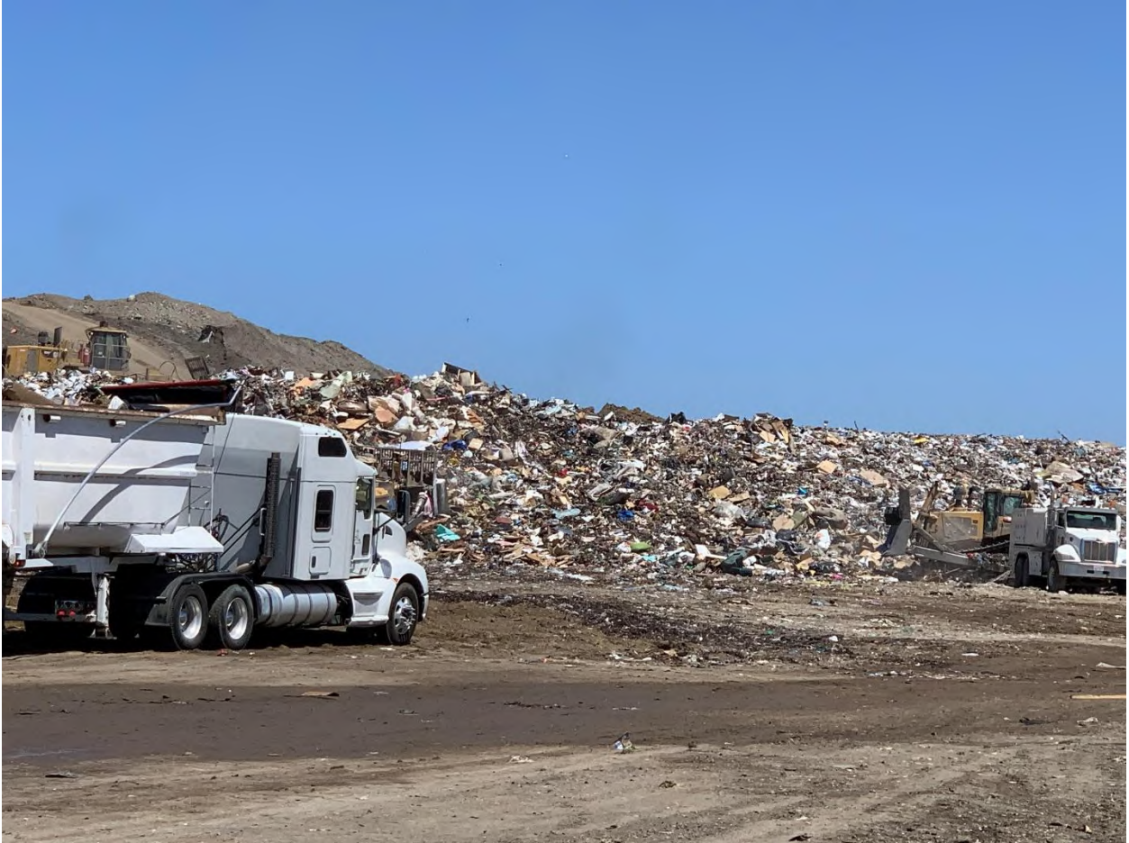
Landfill working face