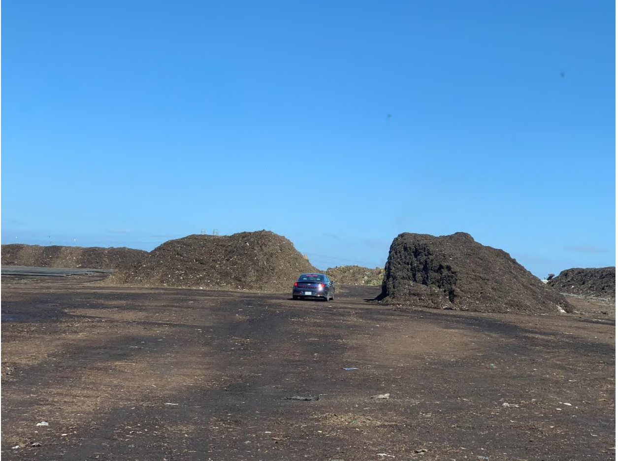
Landfill Compost Piles