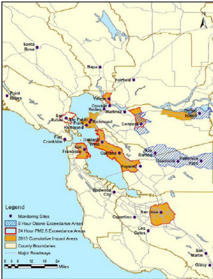
Figure 1: 2013 Impacted Communities

For over sixty years the Air District has been implementing programs to reduce air pollution and public exposure. Air District actions include: conducting air monitoring and modeling to identify locations of elevated pollution concentrations and to assess potential health impacts (see Figure 1); adopting regulations, plans and guidelines to reduce emissions from stationary (i.e. industrial) and mobile (i.e. cars) pollution sources; enforcing existing Air District regulations and the state's mobile source regulations; providing grants and incentives to reduce emissions from mobile sources (targeted in the Bay Area's most impacted communities); and outreach and education to Bay Area residents on air quality issues and trends. These efforts, in combination with the California Air Resources Board's (ARB)